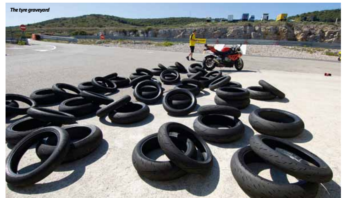
The tyre graveyard

“The pair team-up for a quick steering set of hoops, while remaining perfectly neutral and precise”